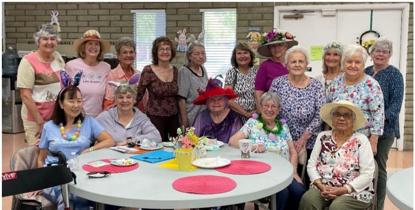
Koffee Klatch Easter Luncheon