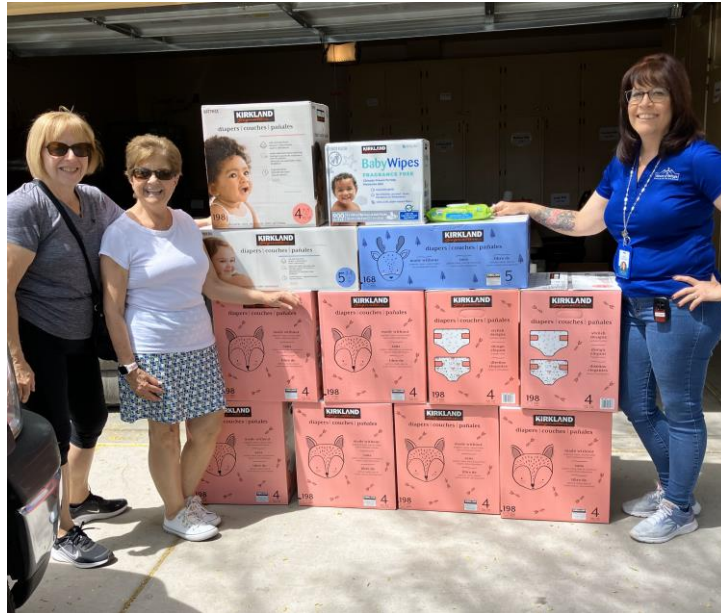
Thank you to Koffee Klatch for their donations used to purchase diapers for House of Refuge.

Memorial Day is May 26 th . This is a day that is set aside to remember with gratitude and pride all those who served and died for our Freedom. May your day be filled with memories and peace.