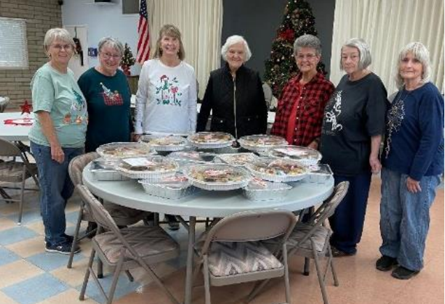
(Missing in picture is photographer Nora Curtin)