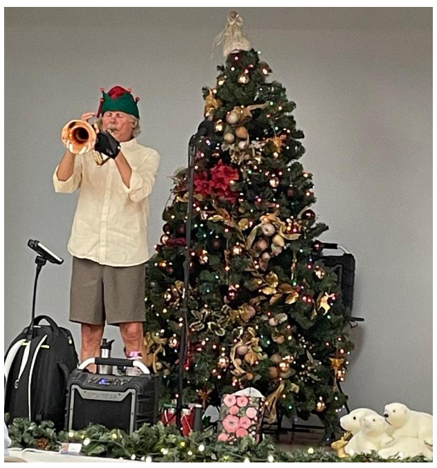
A WONDERFUL TIME HAD BY ALL AT FLUGELHORN PHIL'S HOLIDAY CONCERT.