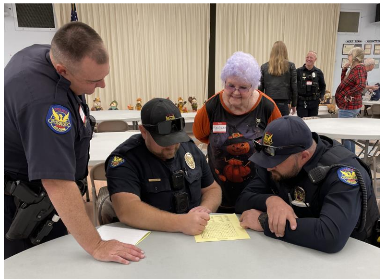
Hard at work on Word Find game