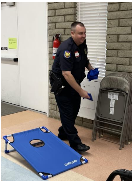
An intense Corn Hole game