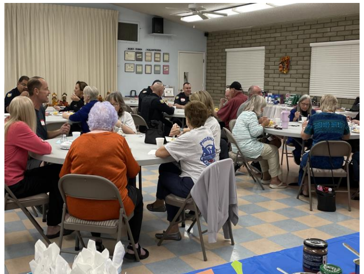
A great turnout!