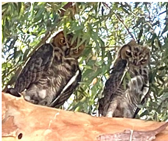
Northtown's Resident Owls

I would like to wish all of us a wonderful Independence Day. While we are enjoying the fun and festivities of the holiday, please take time to appreciate the freedom and protection provided by our constitution.